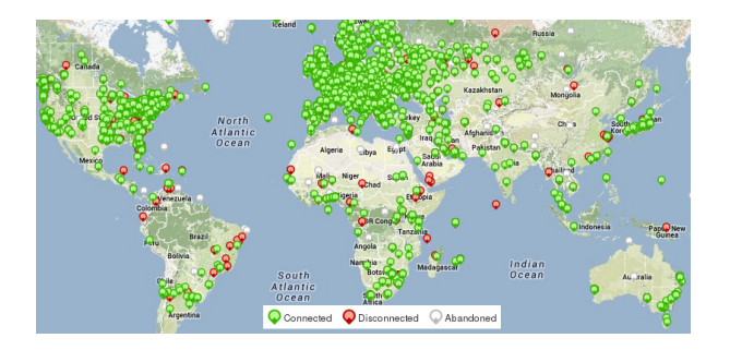
Figure 1: The geographic distribution of Atlas probes as of May 2014. Green icons represent active probes whereas red icons represent probes which are currently offline. The distribution is heavily biased towards the U.S. and Europe.